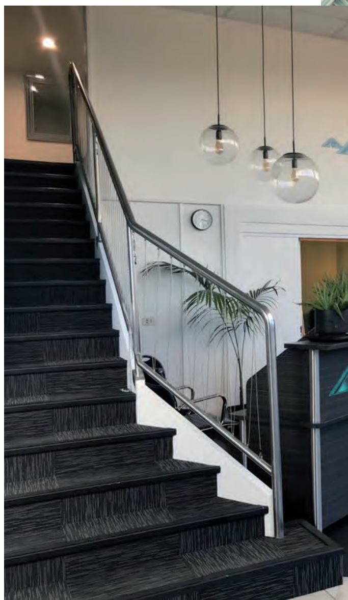
The welcoming reception area of the hub with the kitchen to the rear and kaimahi offices upstairs on the mezzanine floor overlooking the main hub floor.